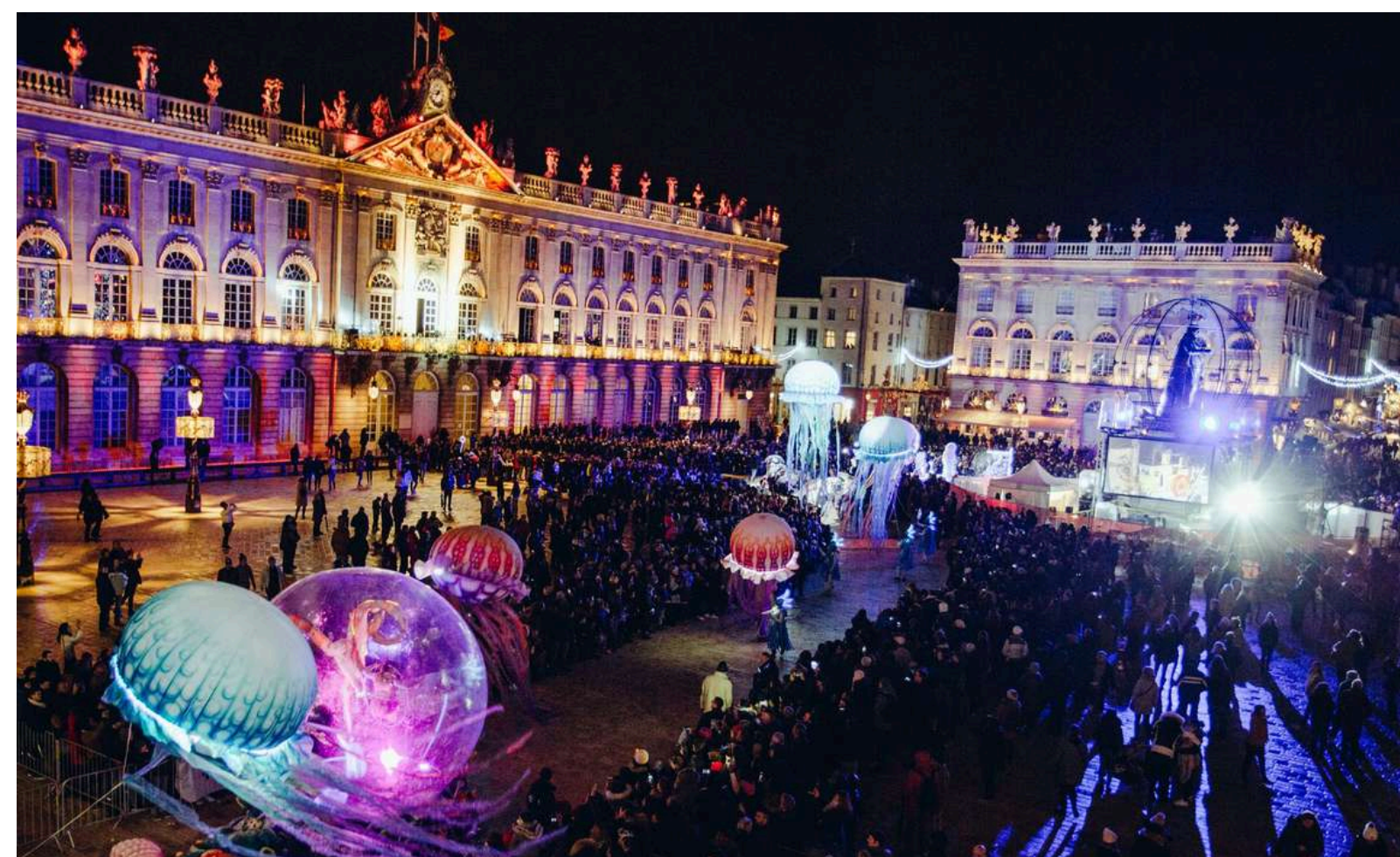
St Nicolas festivities, Nancy