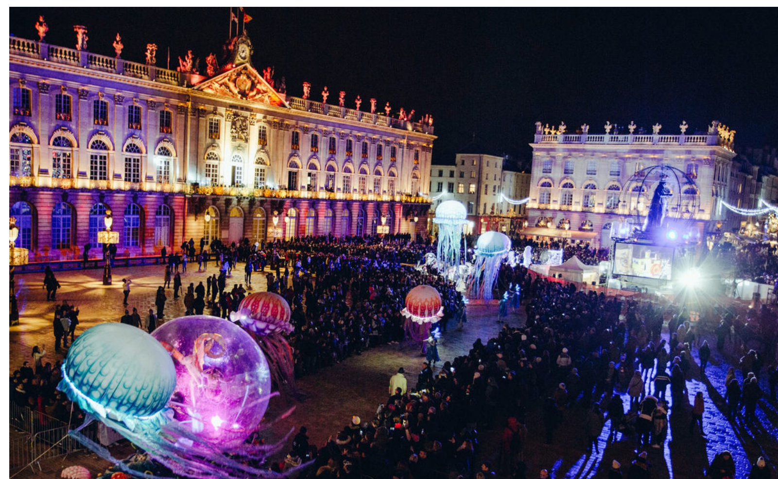
St Nicolas festivities, Nancy